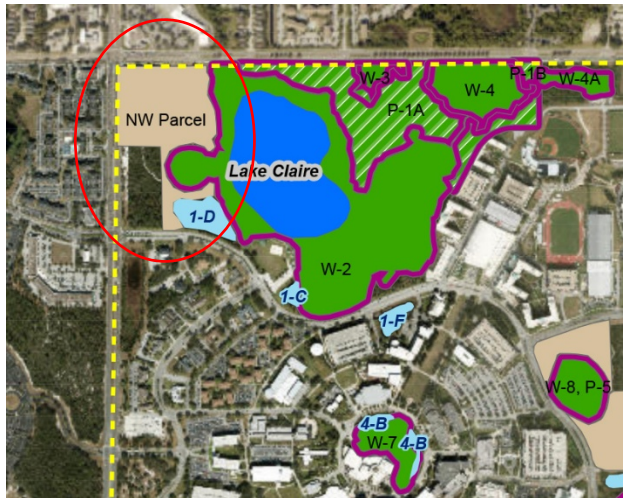
Conservation Lands Map Existing: