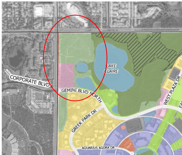
Future Land Use Map Existing: