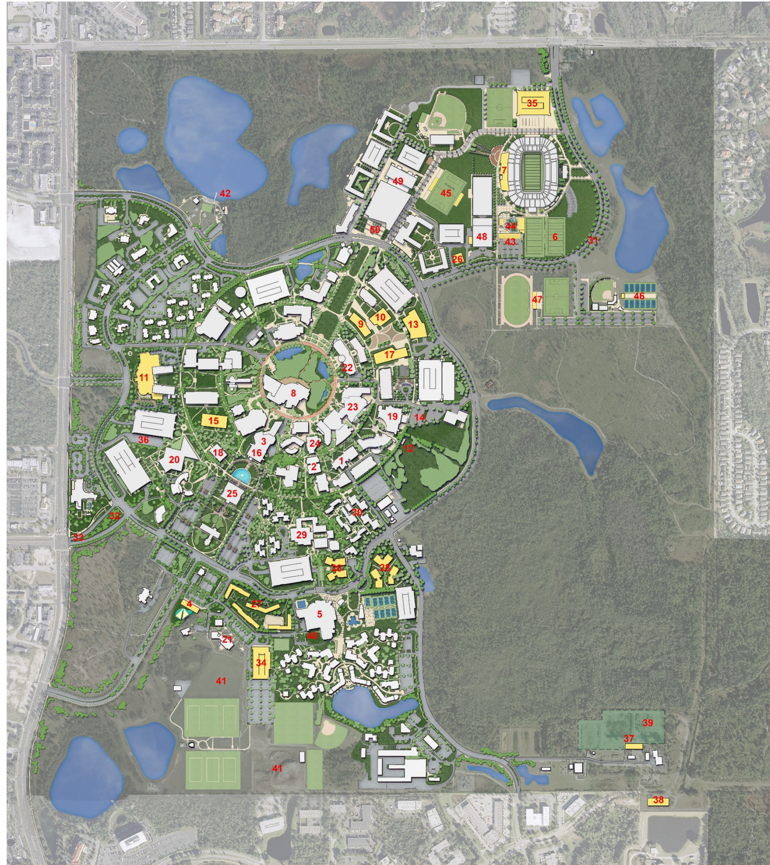
Exhibit 8.4-2 Capital Improvements Map 9