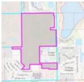
Easements along the UCF boundaries