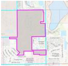
Figure 1.0-2 Easements and Leases along the UCF boundaries